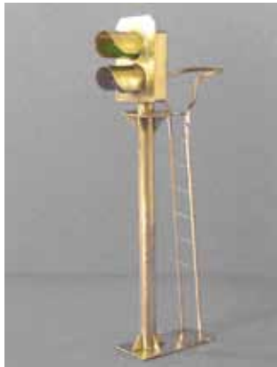
Makes One Signal - 12V DC

Contains small parts Unsuitable for children